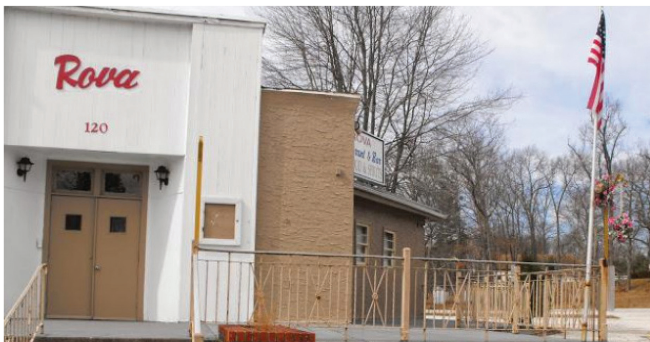
Rova Farms in Jackson, New Jersey

In the early 1930's, the Russian-American financial and social service organization, known at one time to its members by its acronym in the Russian language, ROOVA — Русское Объединенное Общество Взаимопомощи в Америке, otherwise known as ROOVA — the Russian Consolidated Mutual Aid Society of America (RCMASA), purchased some 1400 acres of prime Jersey Pinelands, and undertook a large-scale social experiment, establishing ROVA Farms Resort, Inc., in Cassville, Jackson Township, New Jersey, as a Russian-American cultural and social center, and giving Russian immigrants the opportunity to cultivate the land, grow vegetables, and raise livestock.. Within a few years, several religious, cultural, and philanthropic institutions had been founded: St Vladimir's Memorial Church to commemorate the 950th anniversary of the Baptism of Rus'; St Vladimir's Orthodox Cemetery; St Mary's Russian Orthodox Church; the A. S. Pushkin Memorial Home for Aged Russian People; and the Pushkin Memorial Park. The Leo Tolstoy Memorial Library devoted to the history and archives of Russian immigration in America and a Summer Camp for Children were also established, but have not survived to the present day. □