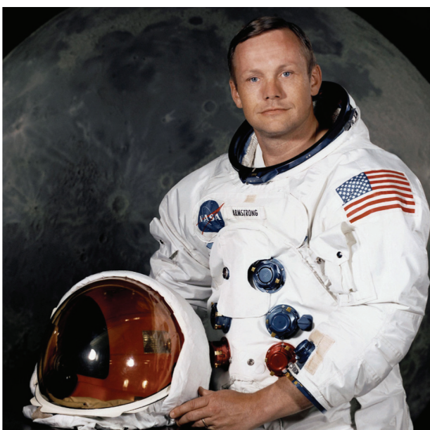
Astronaut Neil Armstrong, first man to walk on the moon. Photo: NASA, 1965