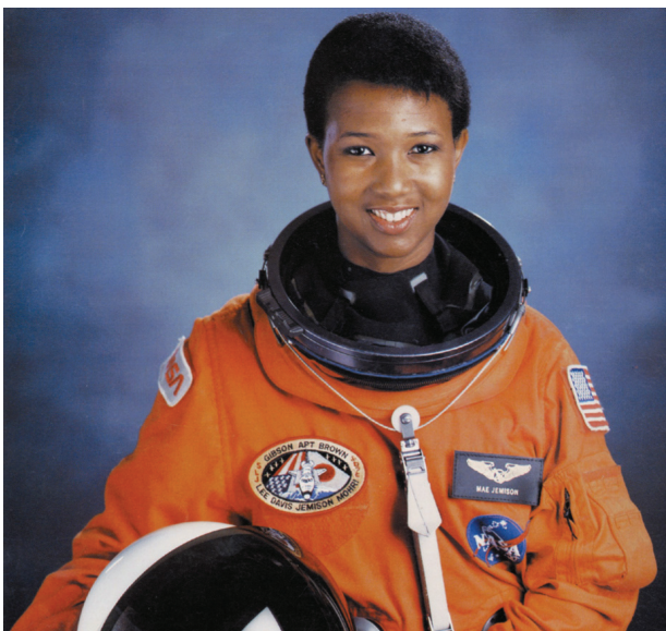
Dr. Mae C. Jemison, First African-American Woman in Space.