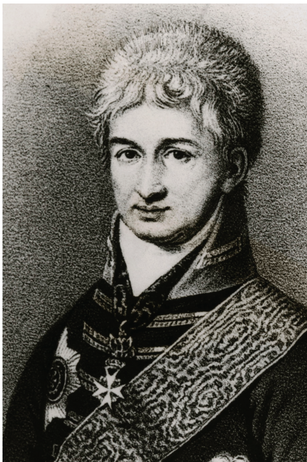
Nikolai Petrovich Rezanov. Date unknown. Photograph of an engraving.

Francisco he managed to win over the governor of Alta California José Arillaga and the fort's commandant and future founder of Los Angeles José Darío Argüello, falling in love with his daughter Maria Concepción.