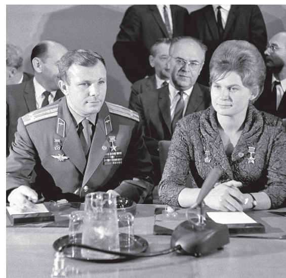
Soviet cosmonauts Yuri Gagarin and Valentina Tereshkova gave a press conference during their visit to United Nations Headquarters (1963). / Советские космонавты Юрий Гагарин и Валентина Терешкова на пресс-конференции в штаб-квартире ООН (1963).