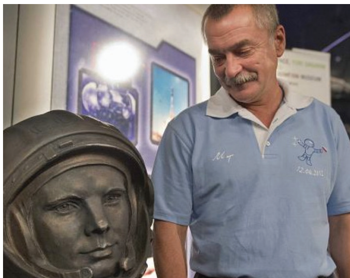
The bust of Yuri Gagarin unveiled at the Cradle of Aviation Museum. / Открытие бюста Юрию Гагарину в Музее Авиации, Лонг Айленд