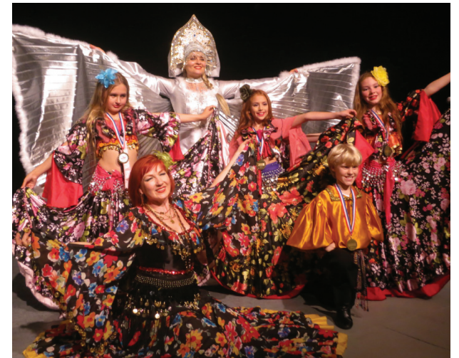
The 7th Children's Festival of Russian Culture, Peter Norton Symphony Space Theater.