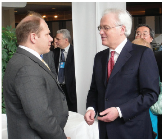
Russia's Permanent Representative to the UN Vitaly Churkin and cosmonaut Oleg Kotov / Постоянный представитель России при ООН, Виталий Чуркин и космонавт Олег Котов