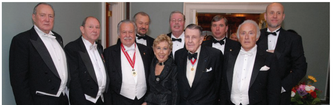
RNA Board Members

Mikhail Baryshnikov, Oleg Cassini and scores of others. Membership in The Association is open to everyone who has the desire to help or the inclination to share their time and effort to ease the burden of the disadvantaged. Today, the Charter of the RNA is an even stronger commitment to continue the long standing traditions of «Nobility,» that is, to help the less fortunate, educate the needy and comfort the sick and indigent. □