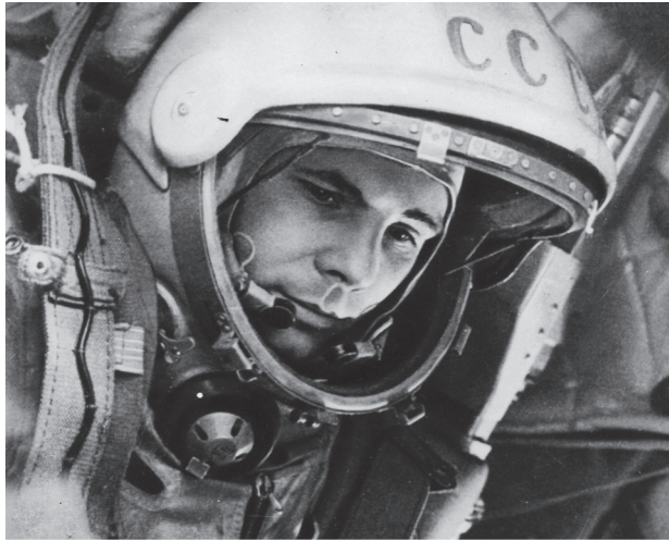
Cosmonaut Yuri Gagarin

Yuri Alexeevich Gagarin was born in the village of Klushino, Russia. Even as a boy he showed an interest in flight, launching paper airplanes in class. However, in 1943, Nazi occupation caused his school to close. Shortly before the village's liberation, the young Gagarin saw a Soviet fighter pilot attack German troops. This act of heroism led to him determining his future career path. Two years after the village's liberation, the Gagarins moved to Gzhatsk where Yuri continued his studies. In 1951, he joined the Saratov Flying Club and later studied at the Military Aviation School in Orenburg, where he played basketball despite his stature of 5'5", graduating with honors. In 1959, after two years of military service in Murmansk, Gagarin joined a select group of candidates to take on the task of going into space. One year later, following extensive medical examinations in Moscow, Gagarin began his training.