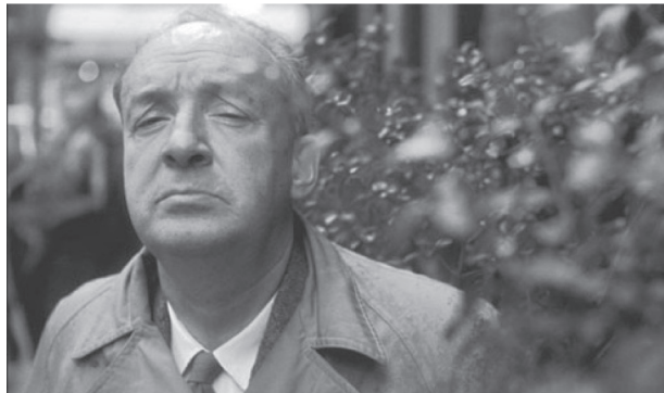
Author Vladimir Nabokov in New York City, 1962

In 1919, Nabokov enrolled in Cambridge, where he